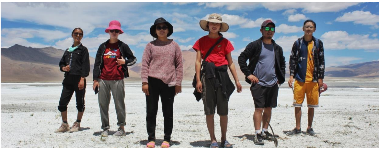
Staff on tour to TSOKAR lake after the completion of tuition.

YAGM members tried to cover maximum syllabus of the students in the classes. The Villagers, including the representatives along with the local and school authorities were very happy with this initiative and presented a token of appreciation to all the volunteers. YAGM will continue to work towards its community with such commitment in the future.