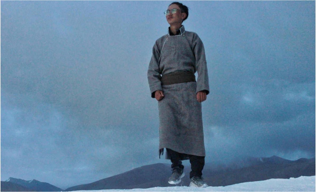
Photoshoot for the upcoming YAGM Magazine.