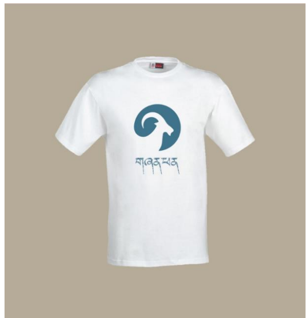
YAGM Hoodies and T-Shirts in making